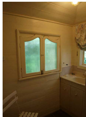
bathroom – before