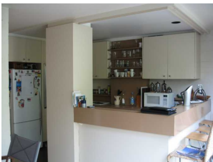
kitchen - before