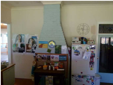
KITCHEN (left) – before