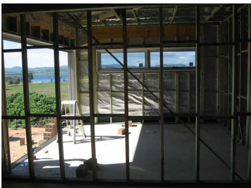
rumpus room view towards the weir

at tabletop, with a view of the hume weir, for another house built by scott james - we provided the detailed design during construction and are looking forward to seeing photos of the completed house.