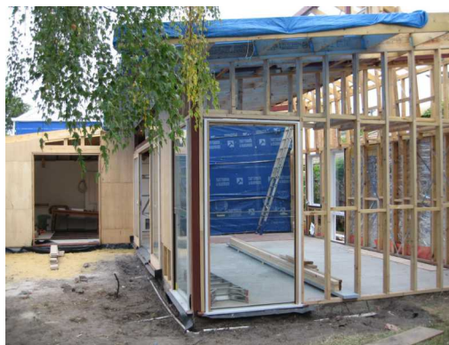
...and during construction (note new windows at same height but with lifted roof and extended eaves)