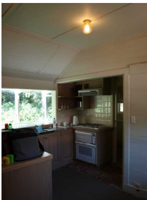
kitchenette – before

while we were busy designing the main house, the restoration and renovation of the existing victorian cottage on the site was managed by the client with the builder, lyon constructions . we had designed & documented these works the previous year - to address the major damp penetration the existing 'brick on ground' floor was replaced with a concrete slab, levels around the house were adjusted to aid water flow away from the house and much of the external corrugated iron cladding was also replaced. luckily the roof was in reasonable condition and could be retained. a large number of the internal timber lining boards were replaced and a new bathroom and kitchenette installed. now completed, the cottage will be used by the client during the construction of the main house.