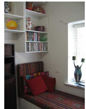
study window seat

nb. su is currently working for classic ceramics so if you need some good quality tiles (like the wonderful IRIS tiles designed by marcel wanders of moooi, pictured above) she can be contacted on 0412 676 233.