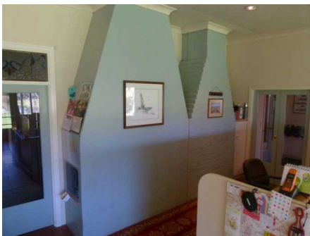
KITCHEN (right) – before