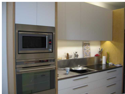
the new kitchen awaiting splashback tiles.....