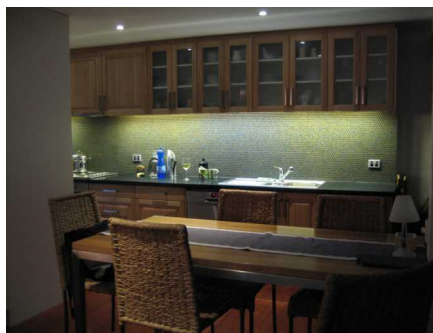
& after (evening shot)