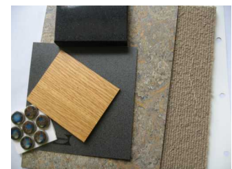
the finishes palette....(daylight!)