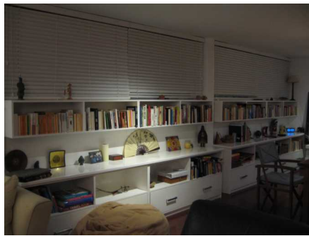
& after (evening shot)