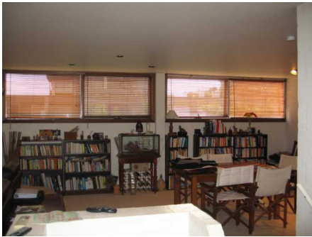
LIVING ROOM – before