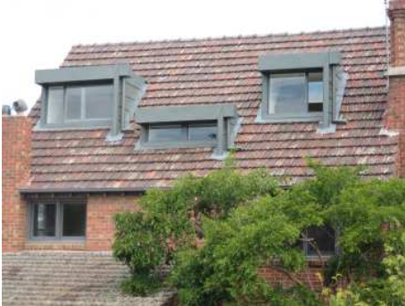
the attic windows

we started the first stage of refurbishment works on this family home back in 2004 and earlier this year completed the second stage which involved converting unused roof space into an attic study and bedroom. we are now working on the design and documentation of stage 3 which will include a new kitchen, laundry, library, living/dining room and rumpus room.