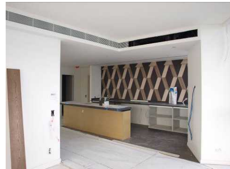
.....and bar detailing feb 2015