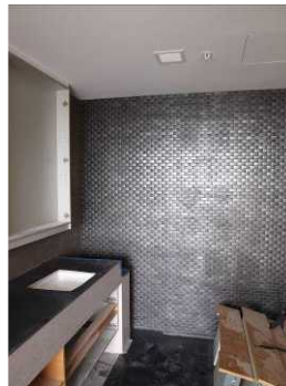
bathroom vanity & tiling