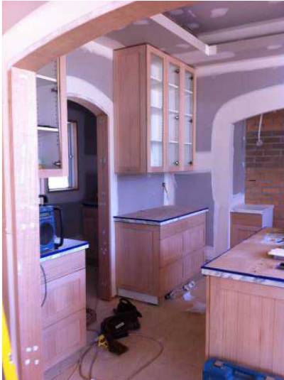
dec 2014 - kitchen cabinetry installed