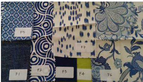
selected fabric samples.....

the client has enjoyed using the renovated cottage (complete now with soft furnishings) over the summer, and keeping an eye on progress next door.