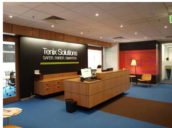
completed reception area