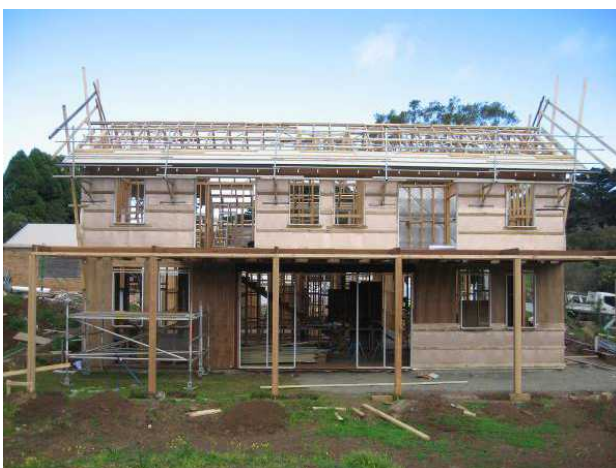
framing almost complete august 2014 (looking south)

it has been very satisfying to be so fully involved in this project; from the initial concept design, through planning, design development and documentation (in conjunction with architectural draftsman greg stephens), administering the contract during construction and also advising on the soft furnishings.