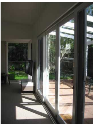
living room view to the terrace

building works at violet grove have been successfully completed by lyon constructions, much to the relief of the client who lived on site during the construction! having done the design, and documentation (in conjunction with architectural draftsman greg stephens) the previous year, we also provided contract administration during the construction phase.