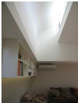
highlight windows to living room.....and kitchen