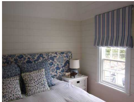
bedhead, cushions & window coverings