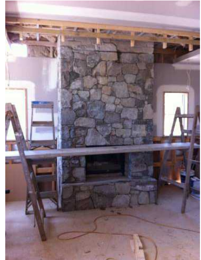
.....and dry stone walling to chimney