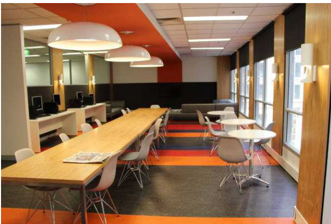
completed staff room

refurbishment works to the staff room and reception area for this call centre were completed late last year by spencer & cartwright .