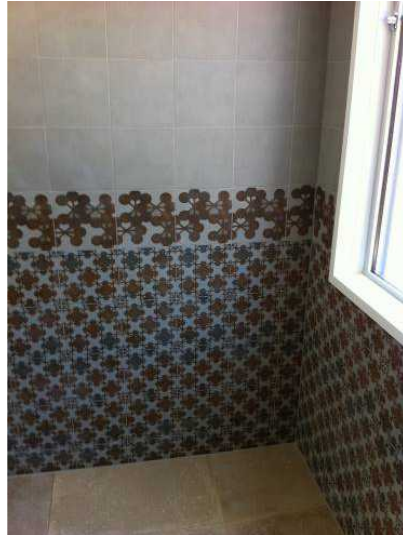
bathroom tiling nearing completion