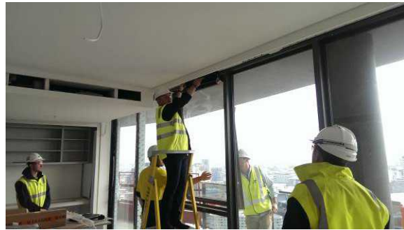
resolving the blind & pelmet detail dec 2014