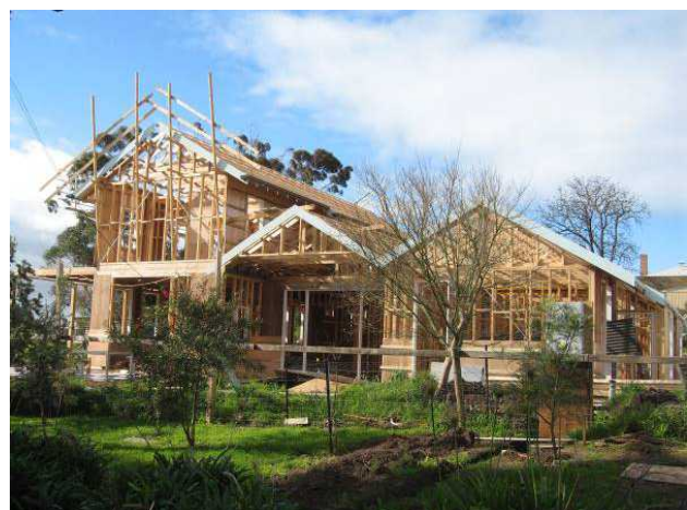
view from st.ann's road (looking east)